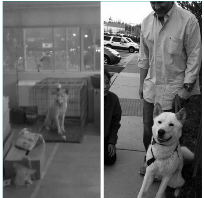
Timber when found by officers and with his new family.

Our animal control officers not only protect the public and enforce the laws, but they are the first responders to some of the most vulnerable in our community—animals in need. Timber, a young Akita, was found by an animal control officer abandoned in a crate in an apartment. Timber was brought to AWLA where his life was transformed and he was given a second chance with his new adopter.