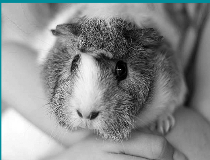
Above: Cottonball Left: Karma