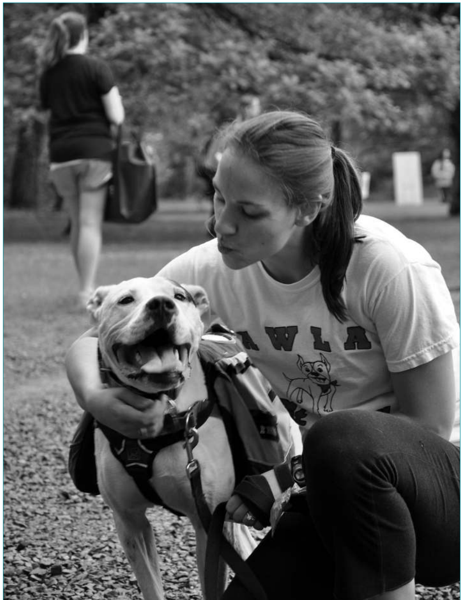
People and dogs enjoyed our 2013 Walk for the Animals.

On June 6th the League participated in Do More 24, a 24-hour day of giving hosted by the United Way of the Nation-