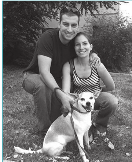
Nina has found her forever family.