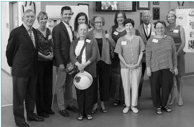
Donors at the 70th Anniversary Sunset Soiree