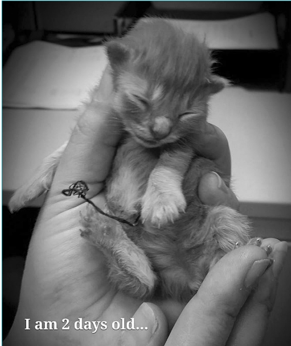
I am 2 days old...

The League's foster program connects special people with special animals. Our 85 foster volunteers selflessly open their homes to vulnerable animals who may not survive without individual, and sometimes round-the-clock, care. Unweaned and underage kittens, pregnant cats and dogs, underage puppies, adult animals that are recovering from medical treatment or who need some special TLC are all candidates for foster care. Foster animals may reside in the foster home for weeks or even months until they are ready for adoption.