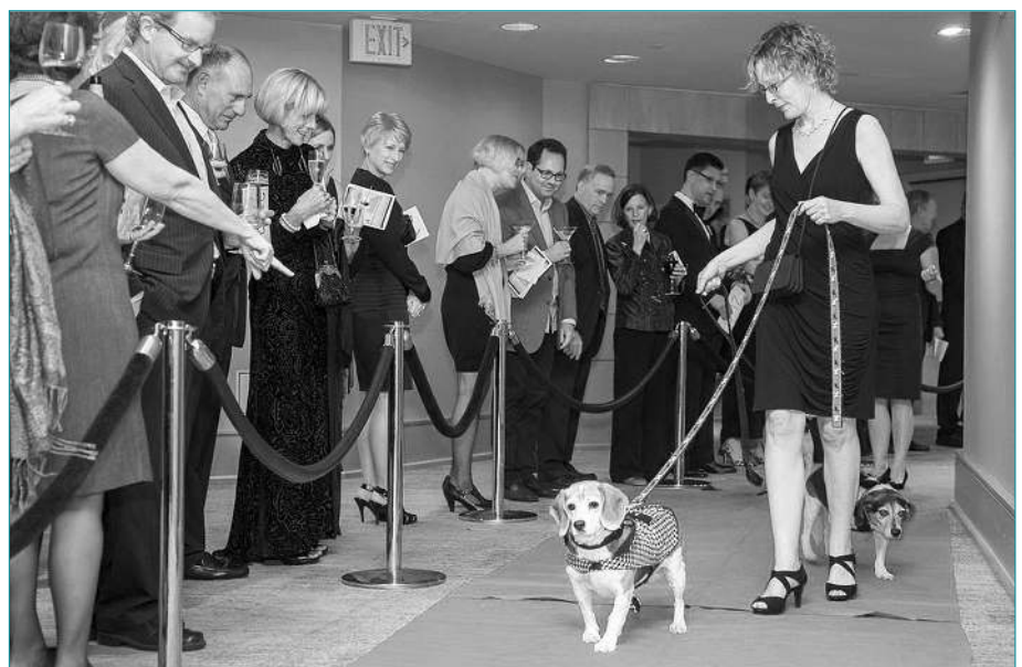
Inaugural Golden Paw Gala