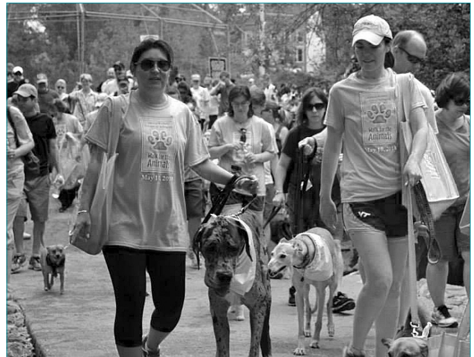
Walk for the Animals 2014

This year we celebrated our 70th Anniversary with a tented cocktail reception at the shelter. Donors to our Care and Transform capital campaign as well as supporters and volunteers enjoyed live music from the Smithsonian Jazz Masterworks Orchestra Quintet, drinks, hors d'oeuvres, and tours